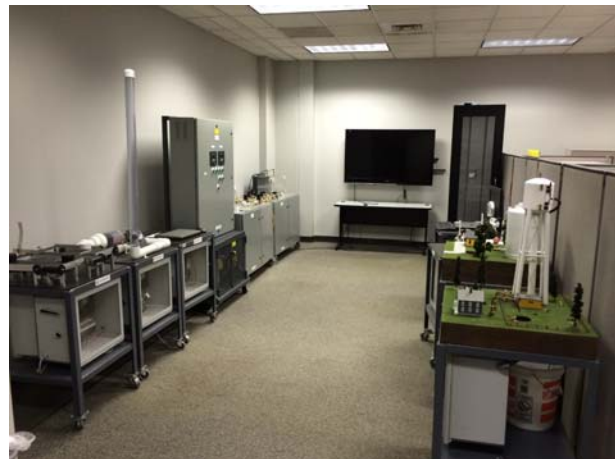
Figure 2: Cyber Physical Systems Laboratory at MSU

In order to attract good students to a program, they have to be convinced that it is worth the investment of their time and resources, but to have a world-class program, that program has to have good students. In cyber-security, motivated students are needed that are willing to do what it takes to learn cyber-security and focus their education on it. This is the only way to build a successful program. Students have to graduate and go to work in the industry and be exceptional in their performance to get the program they graduated from noticed and recognized as a quality program. But, in order to get students, a relatively good program has to exist.